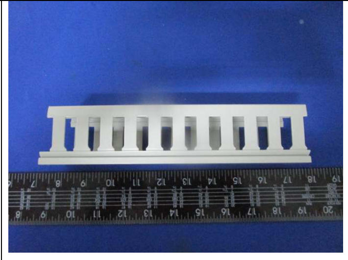
Sample after test

The testing report/certificate only refers to the sample(s) tested.